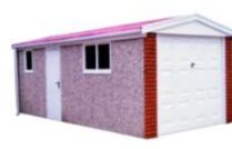
Steel Side Door Included