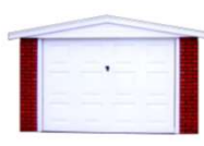
Real Brick Front Included