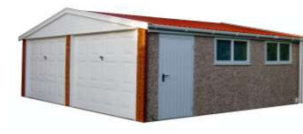
Ultimate Double Apex Shown as Standard