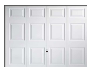
Georgian Door Included with Apex