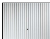
Standard Door Included with Pent