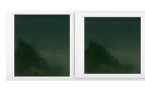
Double Glazed PVCu Window(s) Included