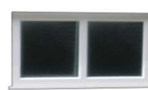
Double Glazed PVCu Window(s) Included