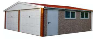
Ultimate Double Apex Shown as Standard