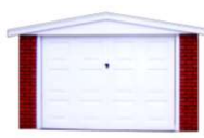
Real Brick Front Included