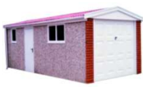
Steel Side Door Included