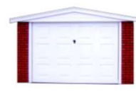
Real Brick Front Included