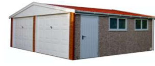
Ultimate Double Apex Shown as Standard